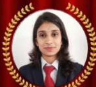
Druthu V 8.45 GPA