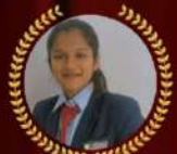
Tulsi 8.91 GPA