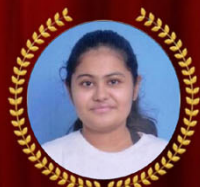
Labdhi L 8.20 GPA