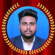
Buvan A 8.96 GPA