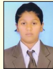
Shre Shakthy 97%